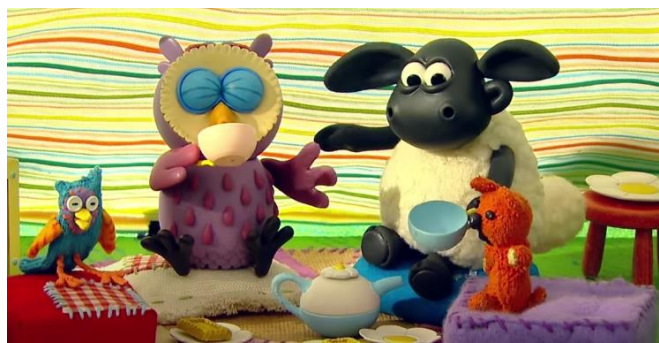
Timmy and Otus use some cups .