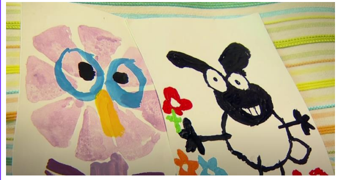
Timmy hangs some paintings .