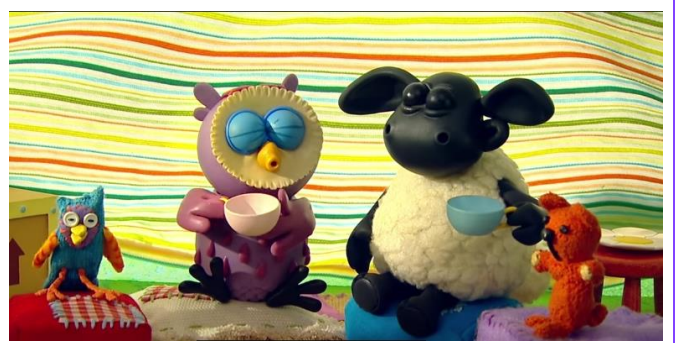
Well done Timmy and Otus!