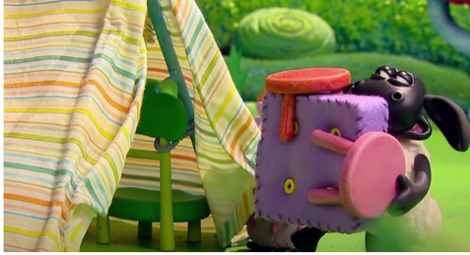
Stools for the den .