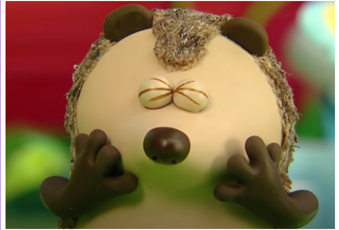
One, two, three, four, five...