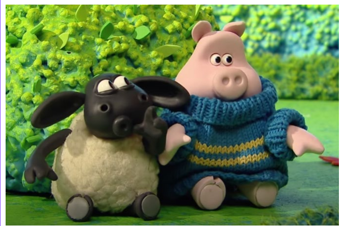
Paxton hides with Timmy. Shhh!