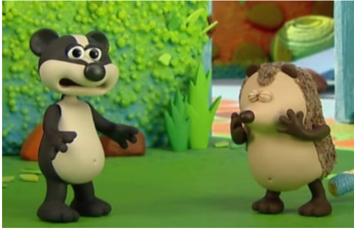
Stripey doesn't hide .