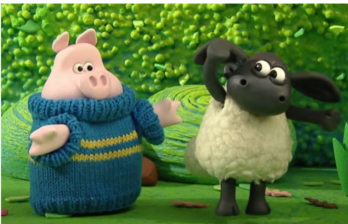
Timmy finds a good place .